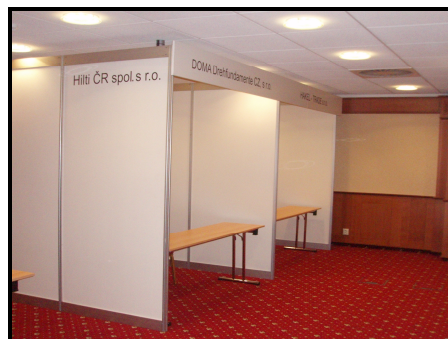
Standard exhibition booth with company logo